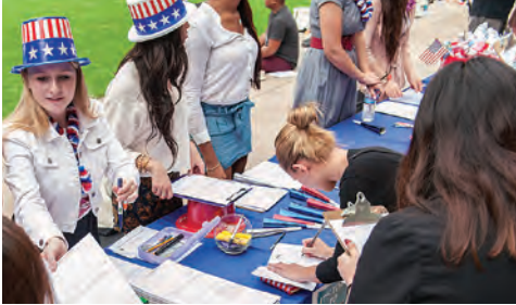
Rock the Vote