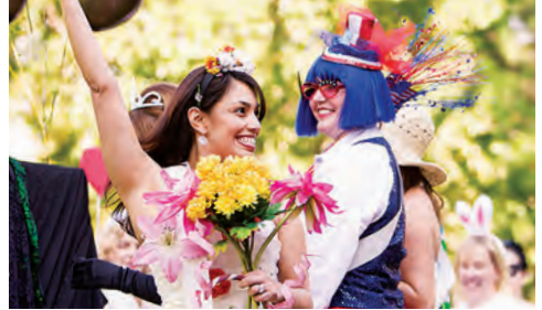
Halloween Costume Contest

The Student Activities Office helps students thrive during their time at FIDM. There are countless opportunities to socialize, network, and connect with the FIDM Community.