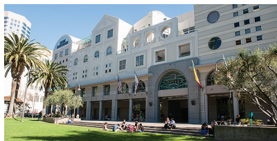
Los Angeles Campus 213.624.1201 800.624.1200

FIDM has established articulation agreements with many colleges and universities for the transfer of credits. Contact FIDM for details.