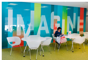
San Francisco Campus 415.675.5200 800.422.3436