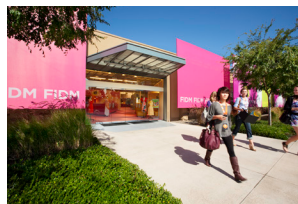
Orange County Campus 949.851.6200 888.974.3436