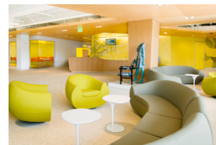
San Diego Campus 619.235.2049 800.243.3436