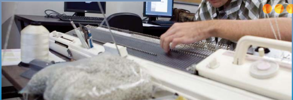
Student works with knitting machine