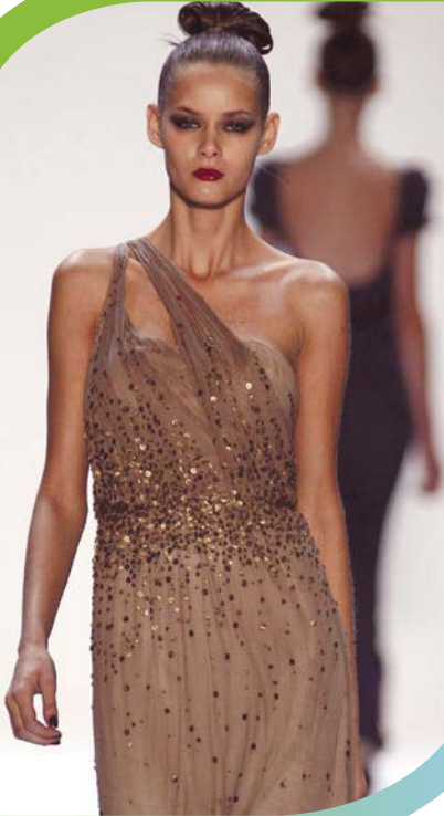
Design by Alumna Monique Lhuillier