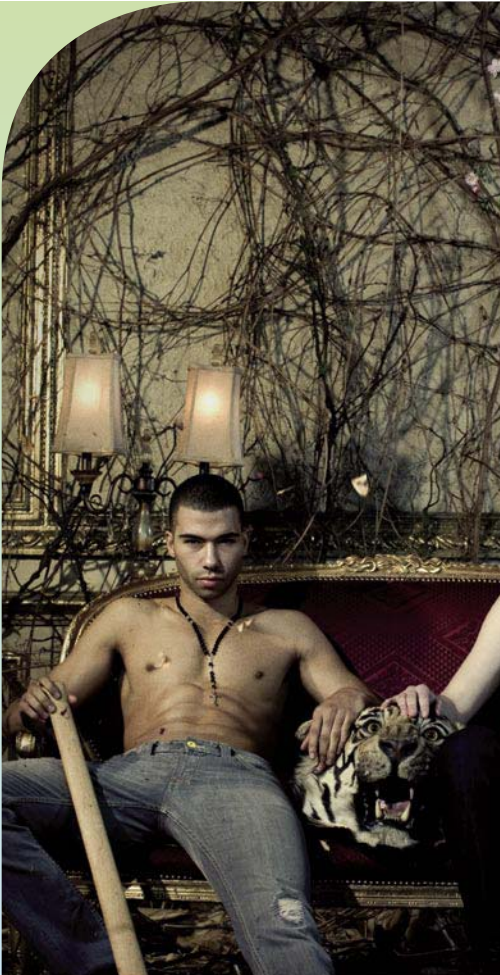
Image from Rich & Skinny look book