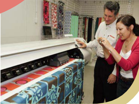
Textile Design students at Marimekko