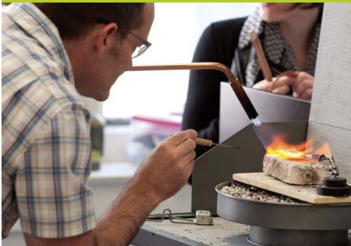
Jewelry Design Demonstration