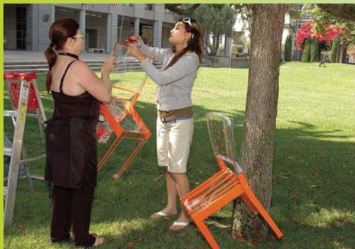
Instructor and Student / Class Project