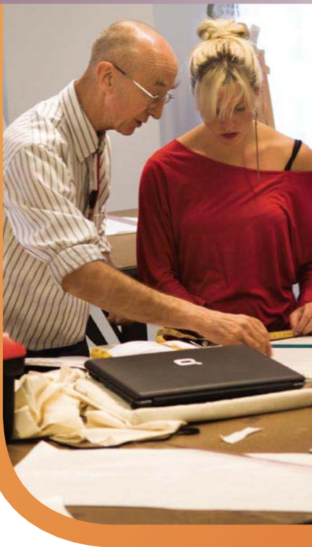
Instructors work one-on-one with students