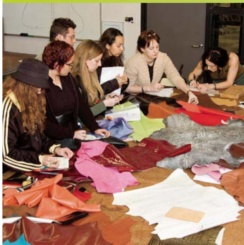
Students learn about different types of leather