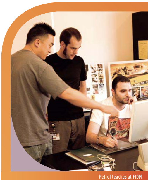
Petrol teaches at FIDM