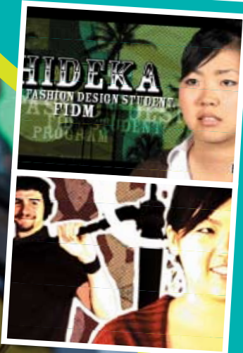
In the Digital Media Program, students explore behind-the-scenes aspects of production and post-production.