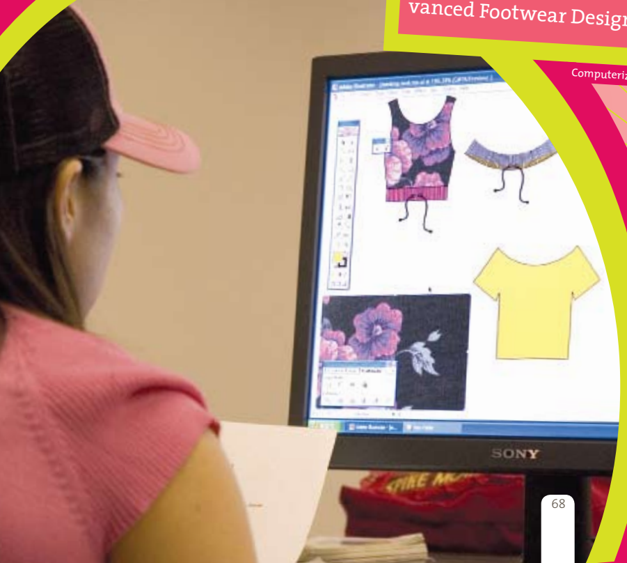
Computerized Flat Sketching class