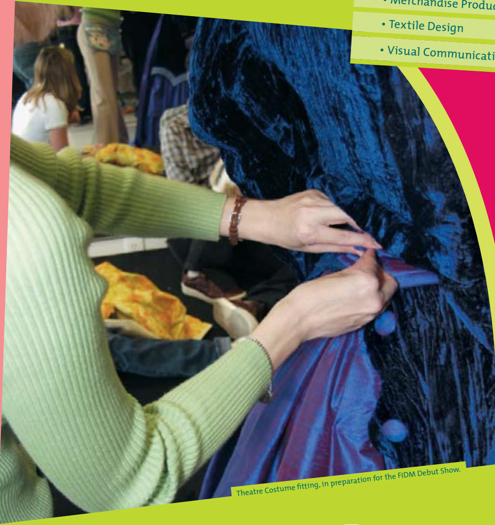
Theatre Costume fitting, in preparation for the FIDM Debut Show.