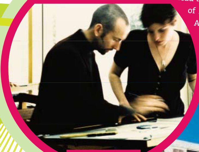
Student and instructor interact in a classroom at FIDM San Diego.

FIDM's focused and challenging curriculum prepares students to enter the global industries of fashion, visual arts, interior design, and entertainment as highly trained professionals. All programs are continually updated to meet the needs of the industries served by the college, and all lead to one of four degrees: Associate of Arts, Associate of Arts Professional Designation, Associate of Arts Advanced Study, or Bachelor of Science in Business Management.