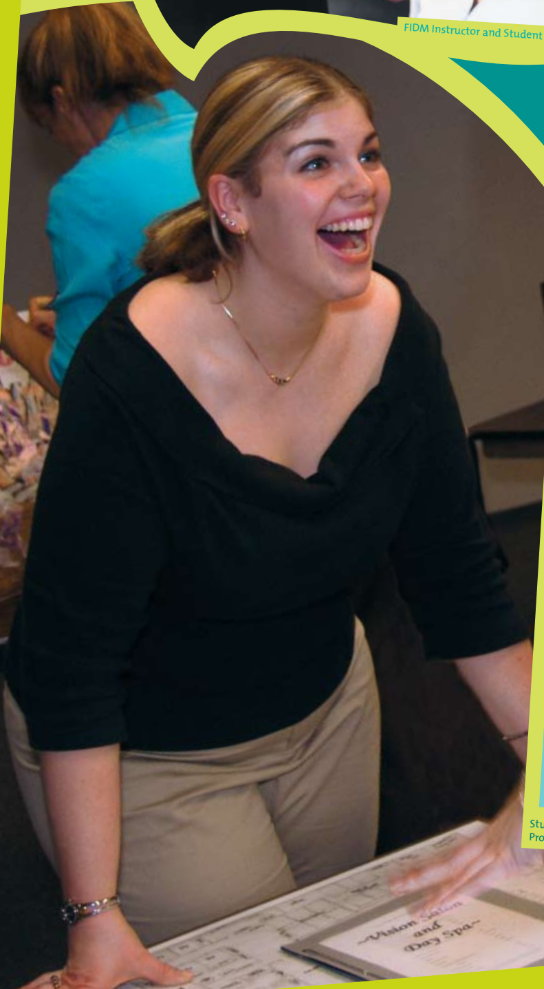
Student in the Beauty Industry Program presenting her project

"As working business people and designers, the contact with FIDM Students renews and invigorates us. They're tremendous!"