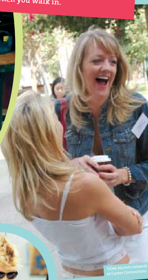
FIDM Alumni network at Career Connections