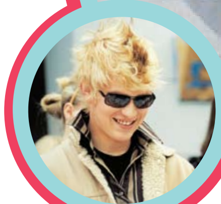
FIDM Student on campus