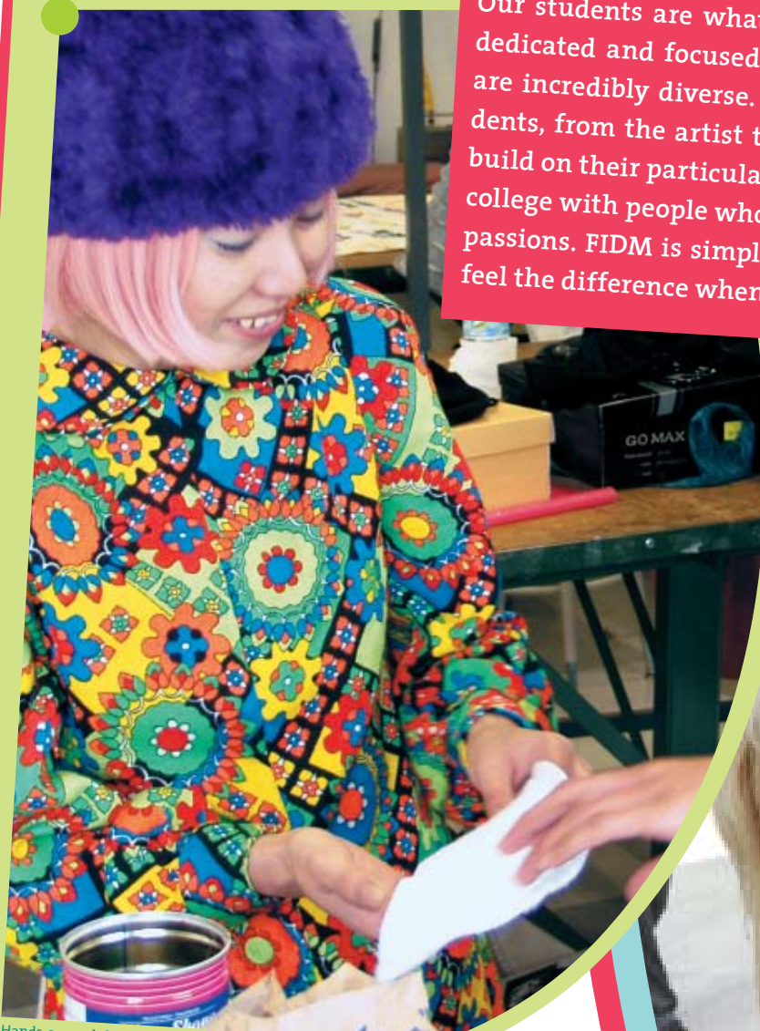
Hands-on workshops are part of the FIDM curriculum.

Our students are what make FIDM so special: they are dedicated and focused. They share common bonds, but are incredibly diverse. We want to help each of our students, from the artist to the entrepreneur, discover and build on their particular abilities. FIDM is about going to college with people who have similar goals, dreams, and passions. FIDM is simply not like any other college. You feel the difference when you walk in.